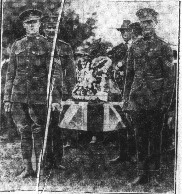
DECORATES GRAVES OF HEROES. Hundreds of people with 200 G.W.V.A. members held impressive memorial service in Prospect Cemetery, Toronto, on Sunday, to veterans who have died or have fallen in action.

brought forward, with the single exception of Baron von Richthofen, the German.