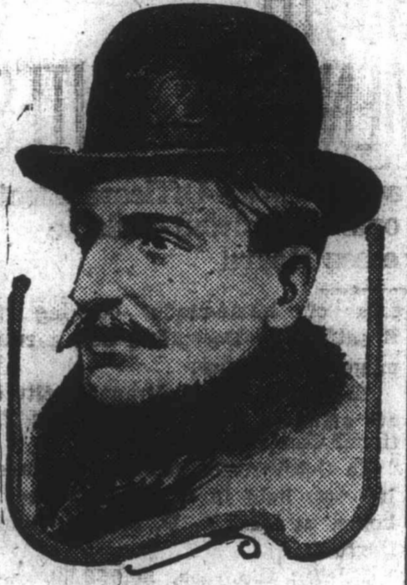
BOLO PASHA. tion of land owned by the Khedive and for the protection of the Khedive's interests in the Suez Canal and in Egypt, in the event that Great Britain should repudiate Abbas Hilmi.

He was identified in several enterprises which failed and then he drifted to Paris, where in 1894 he was convicted of abuse of confidence and swindling.