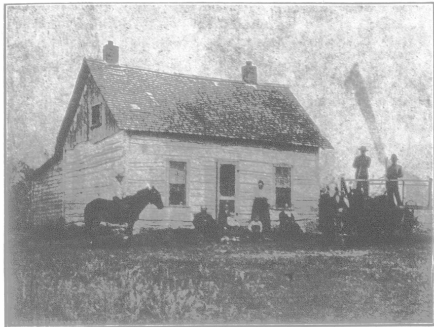
A NEW SETTLER'S FIRST HOME

From the United States, the British Isles and Continental Europe, a steady stream of settlers has been pouring into Canada, totalling in all for the past 12 years over one and one-half million souls.