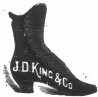
Newest and Most Pleasing Styles.

Bronze, Grey and Black Kid, Plain and Embroidered. Satin In Cream, White, Pink, Blue, Orange, and Garnet