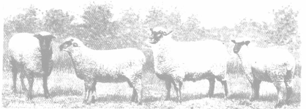
THE PRIZEWINNING OXFORD DOWNS