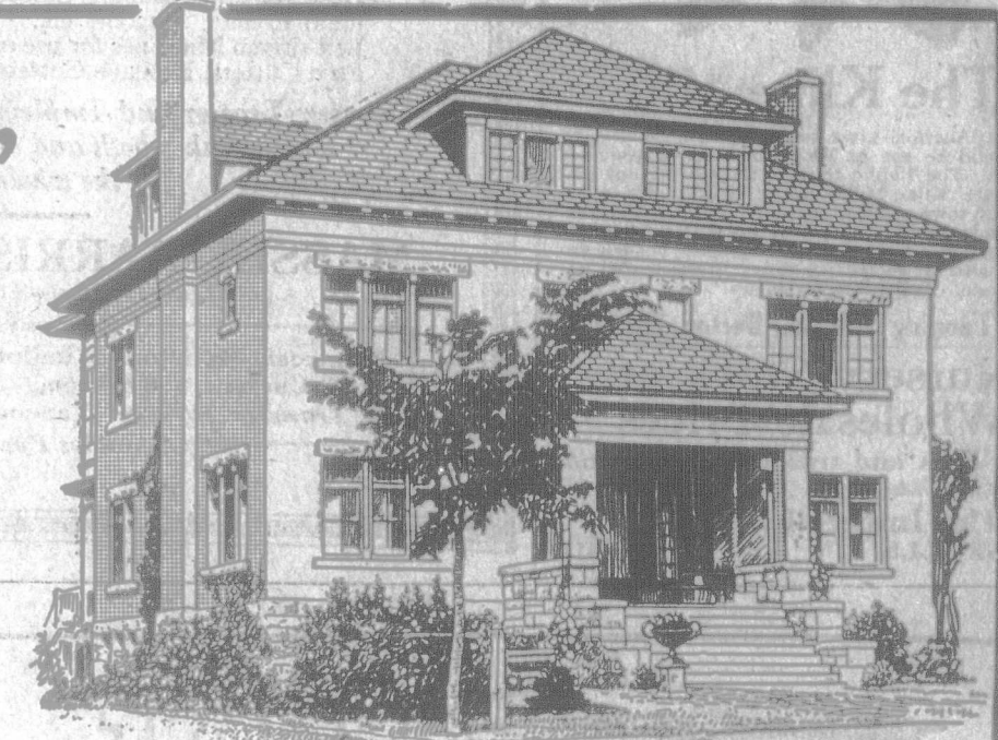
Home in Kingston roofed with Brantford Asphalt Slates

Asphalt is one of the most waterproof materials known, and Brantford Asphalt Slates being non-absorbent, do not get watersoaked and rot. Neither do they crack, break or fall off. In fact, they possess one great advantage over any other form of roofing material:— they cement together under the heat of the sun shortly after