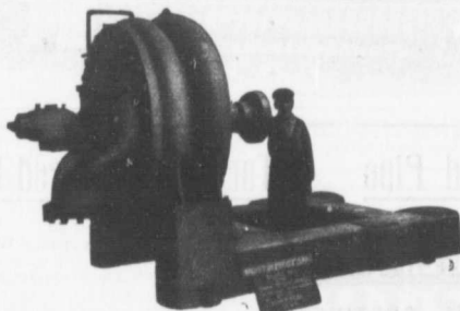
Worthington 2 Stage Turbine Pump for the Winnipeg Water Works, Capacity 5,000,000 per 24 hours.

We Have Two Stage Pumps in Operation Delivering Against 160 Pounds Pressure