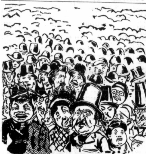
SOME OF OUR VISITORS.