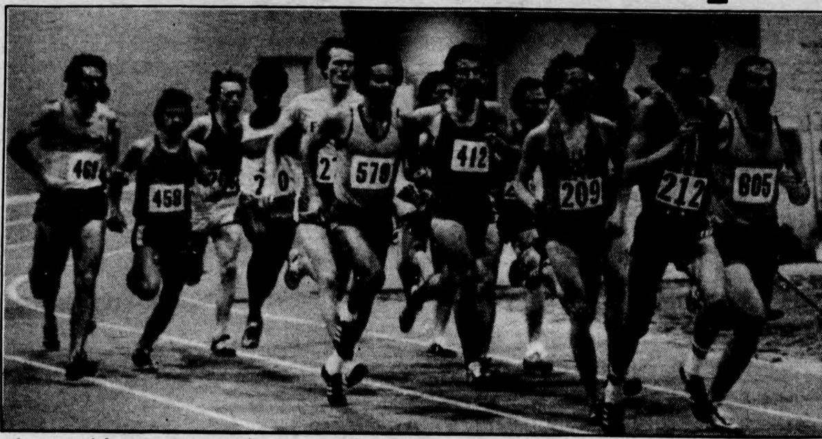
The start of the Star 1500m Trial run, one of the feature events at last week's York Invitational.