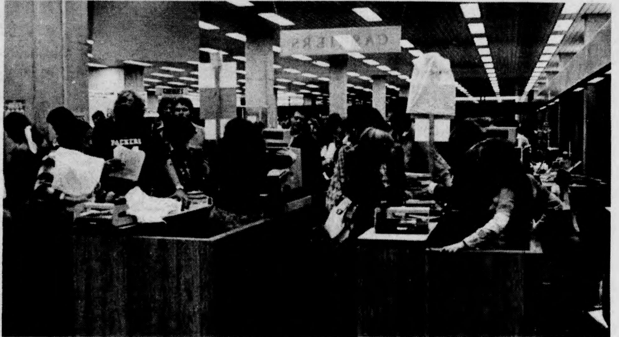
Ahh, the ivy-covered walls of York U. Scholars in gowns, manicured lawns, the scent of fine old brandy in the library, the literate discussions, the romantic autumn evenings. Isn't it great to be back?

But worst of all is the educational cost: fewer courses to