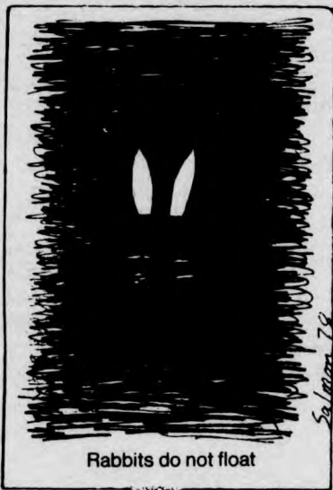
Rabbits do not float