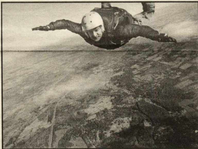
PHOTO OF THE WEEK: definitely not the cowards way out...skydiving with Dalhousie.