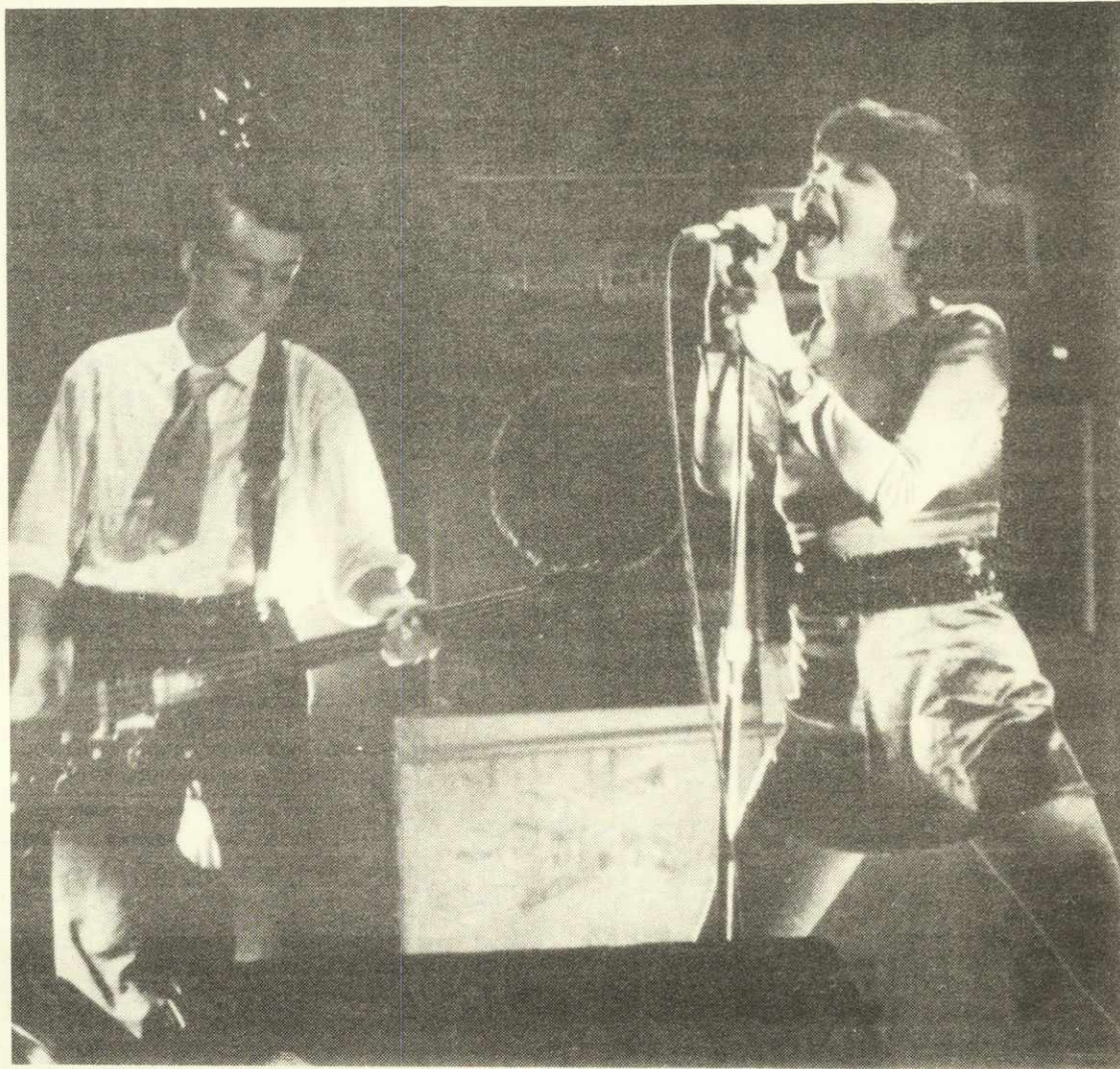
Björk braces as she belts out the Sugarcubes' Icelandic brand of pop with Bragi on bass.

If you have never heard the Sugarcubes, then I would hesitate to recommend this album as an introduction. Start with the first one, Life's Too Good . It had the entire English music press wetting their pants in stunned amazement. It is also about 20 minutes longer and is the band's most diverse album. I would also highly recommend Live Zabor , their video compilation of interviews and