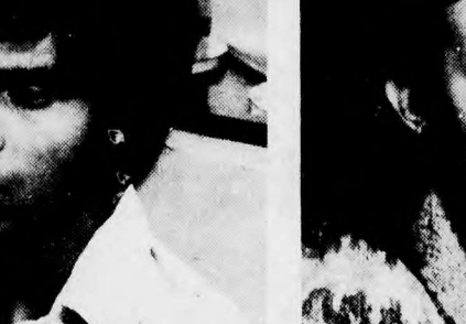
for amateur production.