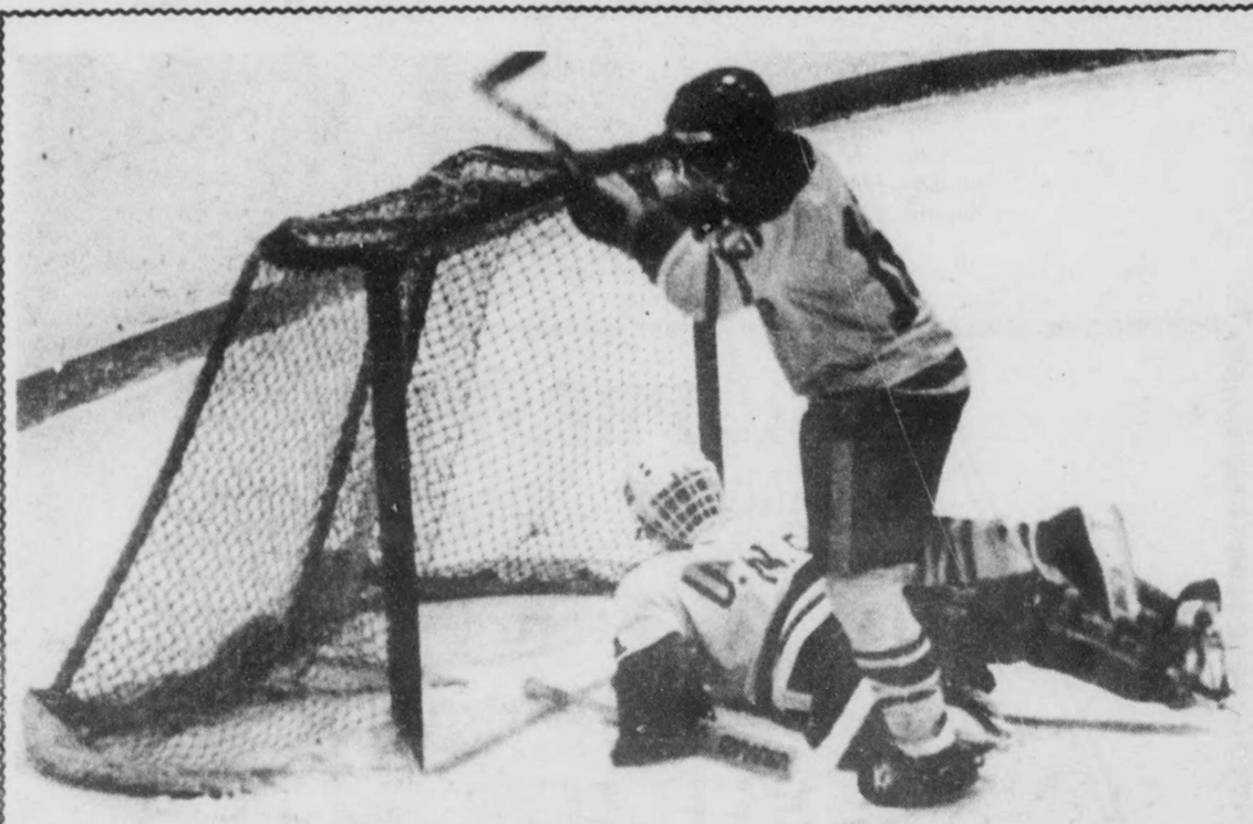
On Wednesday night The St. Thomas Tommies scored with 25 seconds remaining to tie the UNB Red Devils. The final score was 3-3.

To sign up or for more information please phone the Racquet Club at 455-2111.