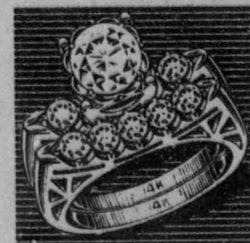
Charm, elegance, style in rings of superb quality. From $25.00 up

How often we hear that remark! Folks seem surprised when we show them that diamonds that look almost alike are so far apart in price. Size is a minor factor. Color differences can depend on many things. Cut and imperfections are not always glaringly obvious. So it comes down to this: your jeweler's integrity counts a great deal when you buy a diamond. Don't treat it lightly. We don't.