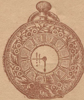
MISSES SILVER WATCH.

of eight new yearly subscribers at $2.00 each, or thirteen six months subscribers at $1.25 each, enclosing their names and addresses in payment