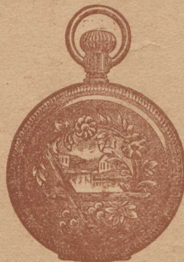
LADIES' GOLD WATCH.

Now we come to the greatest bargain that we have ever made, included with the 5,000 Watches which we have bought was 500 Stem-winding and Stem-setting Ladies' Gold Watches (Hunting Case) they are of an elegant pattern and design being richly engraved and of good make and are excellent time-keepers. We bought these Watches at a slaughtered price, they are the same as retail in stores at about thirty dollars—seldom if ever below twenty-eight dollars each; they are bargains for our patrons as well as for ourselves. We will deliver one of them free in Canada or the United States to any person who will send us eleven yearly subscribers at $2.00 each, or fifteen six