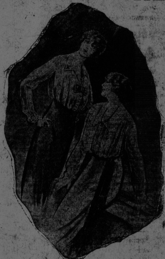
These are afternoon dresses. The bodice is of nylon with touches of beige embroidery. This style is suitable for most figures.