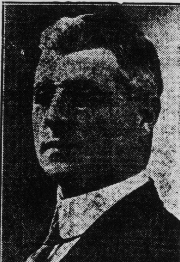
HON. HUGH GUTHRIE who will lead the Conservative Party in Parliament during the coming session.