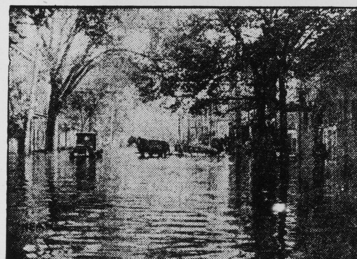
Swollen by heavy rains, Illinois rivers and creeks put the towns of Beardstown and Lincoln under water, stopped traffic and industry, and inflicted privation and danger on thousands of residents. These pictures, the first from the flooded zone, show (left) Lincoln residents hauling sandbags through waist-deep water to keep the flood from swamping the light plant, and (right) what the main street of Beardstown looked like after the flood came.

TO JOIN PREMIER OTTAWA, Oct. 12.—(By Canadian Press)—Dr. J. H. Girdale, Deputy Minister of Agriculture, will probably sail next Saturday for England to join the party of Premier King in London.