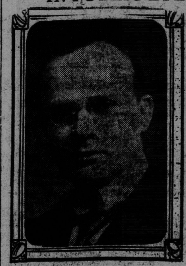
R. B. BENNETT, K.C., M.P., President of the Canadian Bankers' Association. He is Vice-President of the Canadian Bankers' Association, and President of the British Empire Timber Co.