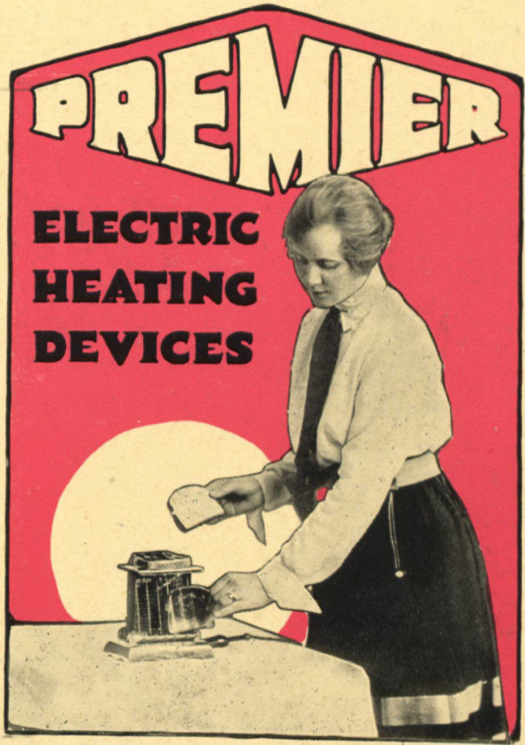
The "Premier" Toaster, shown in actual use, makes two slices of golden brown toast in a tiffy. Always ready for instant use.