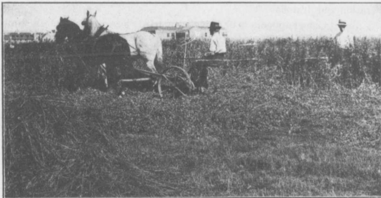
Harvesting Sweet Clover on the College Farm.

Clover has become better understood and its many excellent qualities better appreciated, its utilisation both as a hay and pasture for all classes of live stock has rapidly increased. At present it may be found as a cultivated crop in practically every province and state in America.