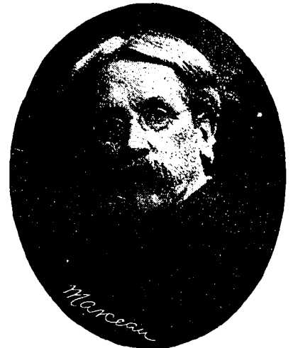
GEORGE CARY EGGLESTON, AUTHOR OF "THE MASTER OF WARLOCK."

Decorative Cover, Gilt Top, Rough Edges, Cloth - - - $1.50 Paper Edition - - .75