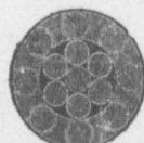
Locked Coil Aerial Cable or Colliery Guide.