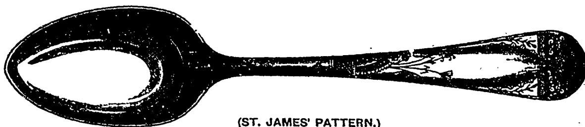
(ST. JAMES' PATTERN.)