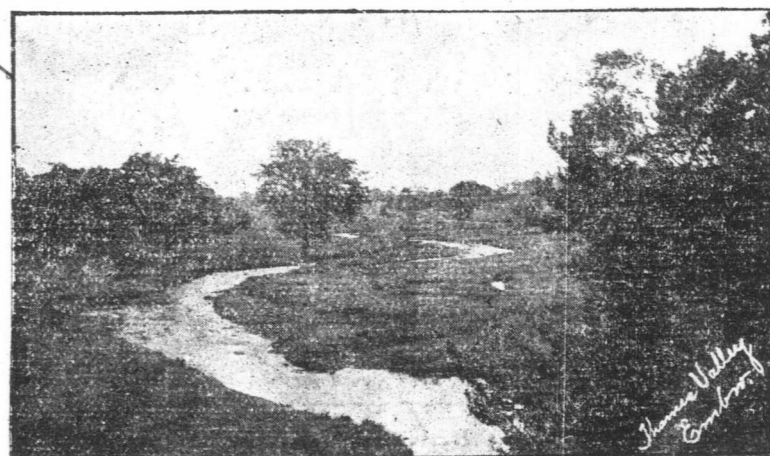
A SCENE IN THE THAMES VALLEY.