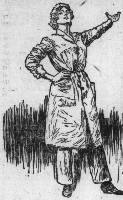
This illustration shows one of the Women members of the Sunlight Soap League, and her husband's costume.