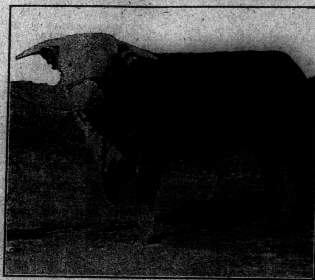
BEAU DONALD 199

The Curtice Cattle Co., of Calgary, sold "Beau Donald 199," No. 26753, 26 months old, to W. M. Parslow of Calgary, for $3,200.