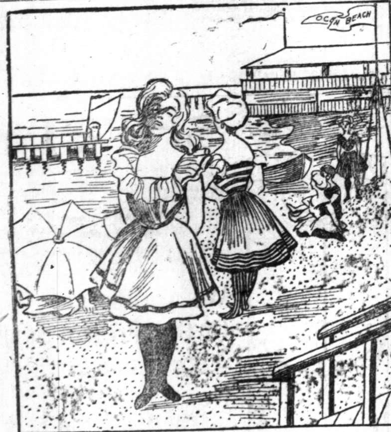
THIS GIRL IS POSING. FIND THE PHOTOGRAPHER AND THE CAMERA.

rich silk grenadines, all wool crepe de chenes, munsey cloths, all wool batiste, albatross, nun's cloths, and cashmeres in all warranted shades, rich broad cloths in black and colors, drap panne suitings, satin panne and satin penellias cloths, rich silk finis; lustrous in evening shades, also