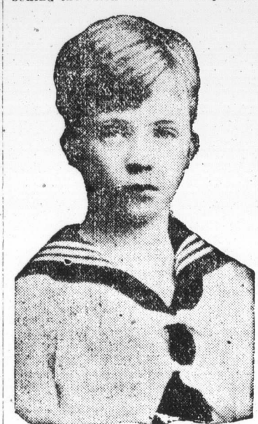
LEOPOLD, DUKE OF BRABANT.

dynasty. The royal family made an interesting picture; the king, in he lieutenant-general's uniform he always wears, tall, broad-shouldered, tanned somewhat from his outing by the sea —they had just come from Ostend behind the thick lenses of his prince-