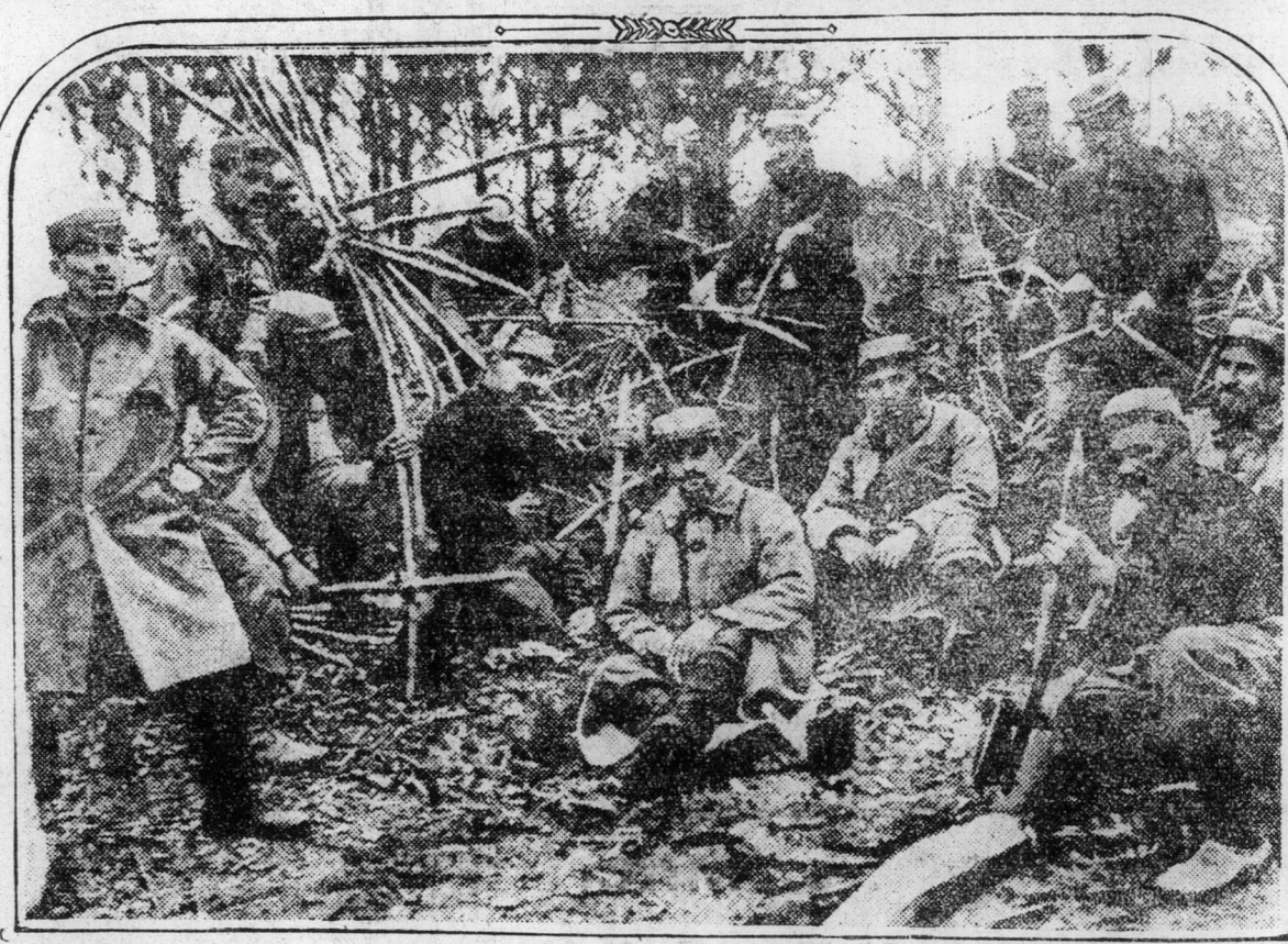
A scene in the woods on the heights of the Meuse is represented. French soldiers are preparing the sticks to form a barbed wire entanglement.