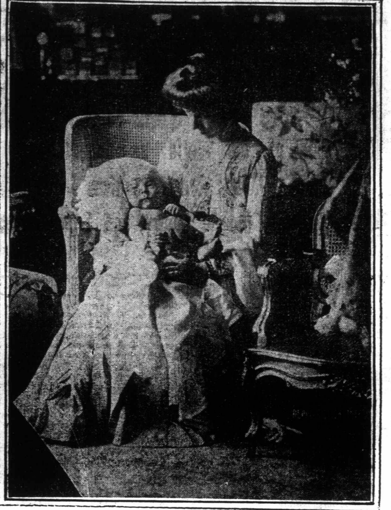
Princess Louise, New Queen of Denmark