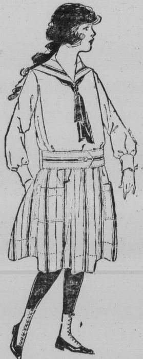
A good dress for the growing girl is this one made of striped and plain materials. McCall Pattern No. 7888, Girl's Simplicity Dress. In 6 sizes, 4 to 14 years. Price, 15 cents.

These patterns may be obtained from your local McCall dealer, or from the McCall Co., 70 Bond St., Toronto, Dept. W.