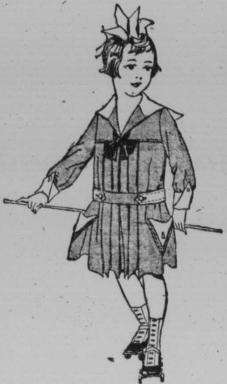
A dress of this type is very smart for the girl, made of tub materials. McCall Pattern No. 7658, Girl's Pleated Dress, in 6 sizes, 4 to 14 years. Price, 15 cents.