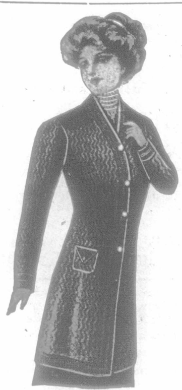
No. M18-147 PRICE $5.00 Shipping weight 3 lbs.

Every Eaton mail order purchase carries with it the assurance of satisfaction, for should any article not meet with your approval it may be returned for exchange or refund of money, all charges being borne by Eaton's.