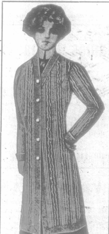
No. M18-144 PRICE $3.50 Shipping weight 3 lbs.

M 18-147. Women's Coat Sweater, made of fine Australian Botany Yarn in fancy zig-zag stitch. Is single-breasted style, with four button closing; length 36 inches. The V-neck, fronts and lower edge are finished with fancy knitted border; pocket either side made with flap effect, trimmed with buttons. COLORS—Plain white, grey or brown. SIZES—34, 36, 38, 40, and 42 bust.