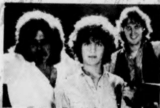
Alpha Band - see what I mean?

being hypnotized. You are not laughing at these guys. You are going to find their album in the delete bin at the record shop.