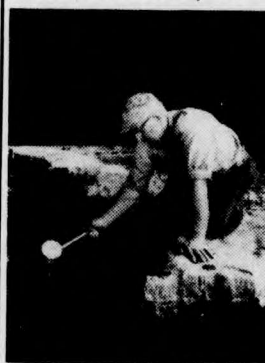
Our own iron-free water

AT THE JACK DANIEL DISTILLERY , we have everything we need to make our whiskey uncommonly smooth.