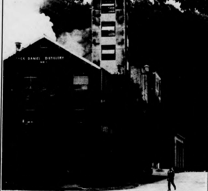
Jack Daniel Distillery. Named a National Historic Place by the United States Governm

AT THE JACK DANIEL DISTILLERY, we have everything we need to make our whiskey uncommonly smooth.