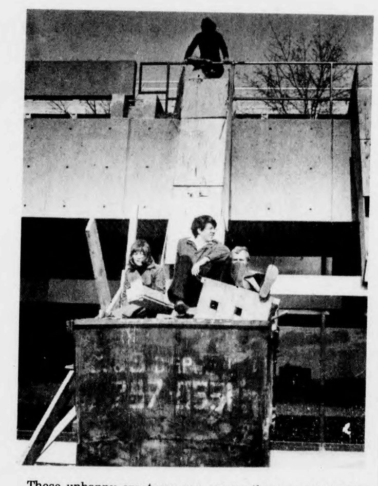
These unhappy creatures are among the many FAILED STUDENTS® that York produces each and every year. Observe closely their gnarled faces, their gimpy limbs, their shattered prospects. Woe betide the FAILED STUDENT®. Don't you be among them. Study, rack your brains, cheat, swindle and, most of all, kiss ass.