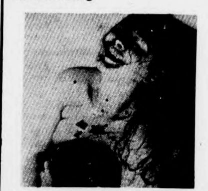
Scene from 'Oh Dem Watermelons'

They are not, I believe, for the casual viewer, but for the movie buff they are jolting, perhaps a little shocking, and incredibly mesmerizing.