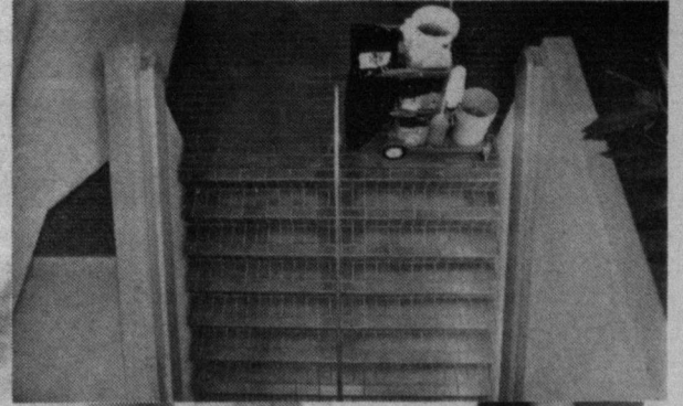
...6:00 pm... the cycle repeats itself as the janitors prepare for Monday mornings rush.