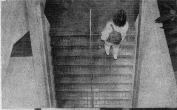
8:30 am... the stampede is yet come...