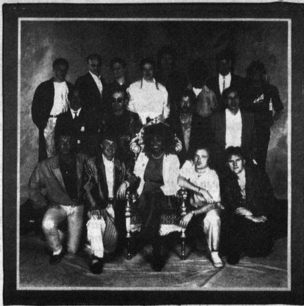
Top 40 types sing for charitable cause

Prince's Trust, then, makes for mostly enjoyable if hardly essential listening. Whether or not it's for you probably depends on the strength of your affinity for the contributing artists — as well as your charitable instincts.