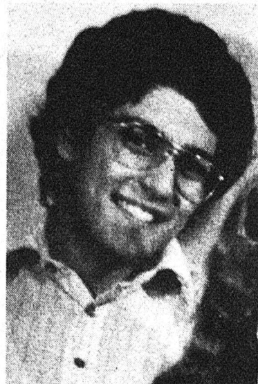
Before and after.