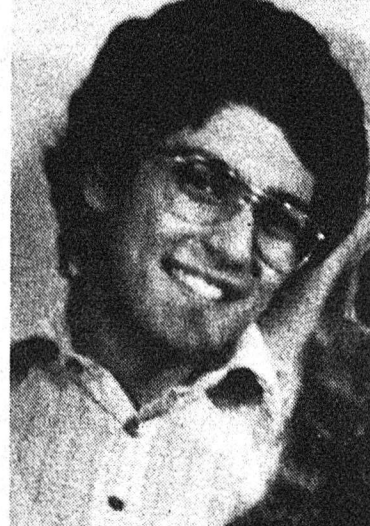
Before and after.