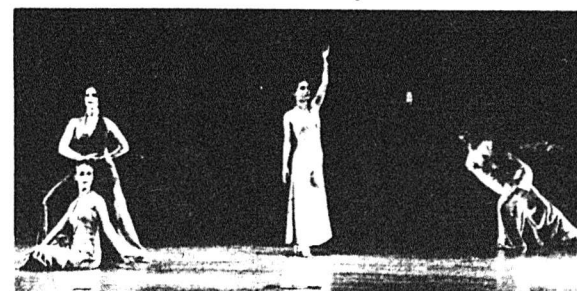
Alberta's most successful dance Company presents 5 exciting new dances.

Friday & Saturday Jan. 23, 24 8:30 PM Tickets from $3/SU Box Office/Door