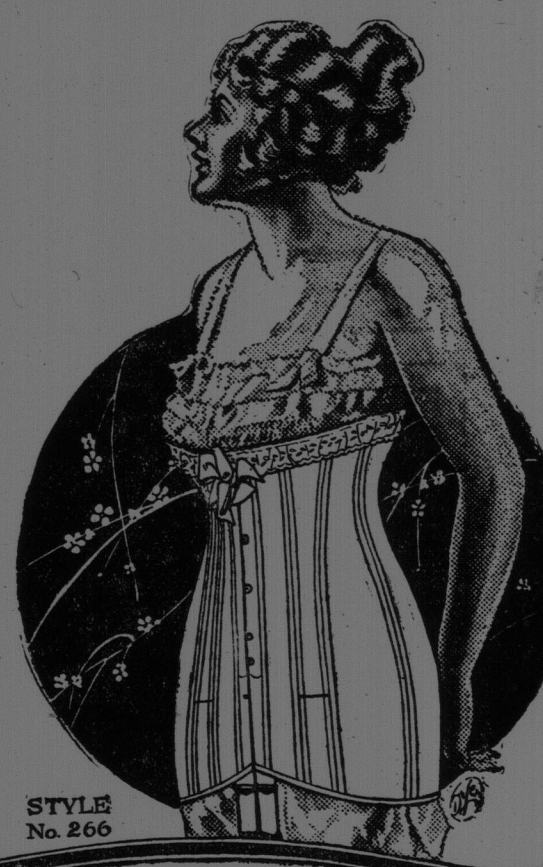
STYLE No. 266