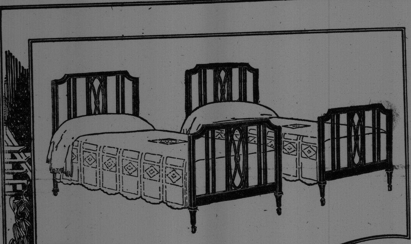
The "SHERATON" Design 1967-In Twin Pair