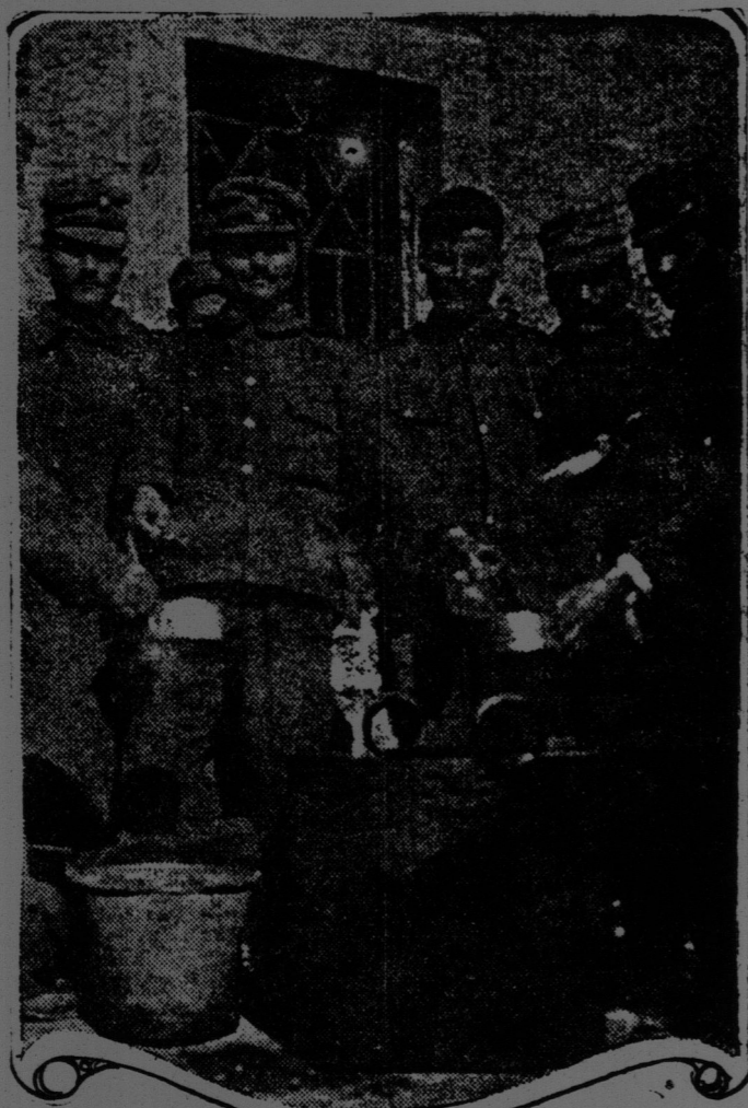
Picture of King Constantine's fighting men in the new field uniforms that have replaced the ancient "Greek ballet" for actual fighting purposes. Up to the time of the Balkan war all Greek soldiers wore a skirt uniform, something like the kilts of the Scotch, and do yet for full-dress parade.