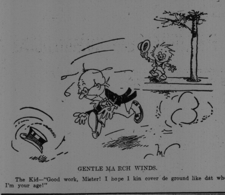
GENTLE MA RCH WINDS. The Kid—"Good work, Mister! I hope I kin cover de ground like dat when I'm your age!"