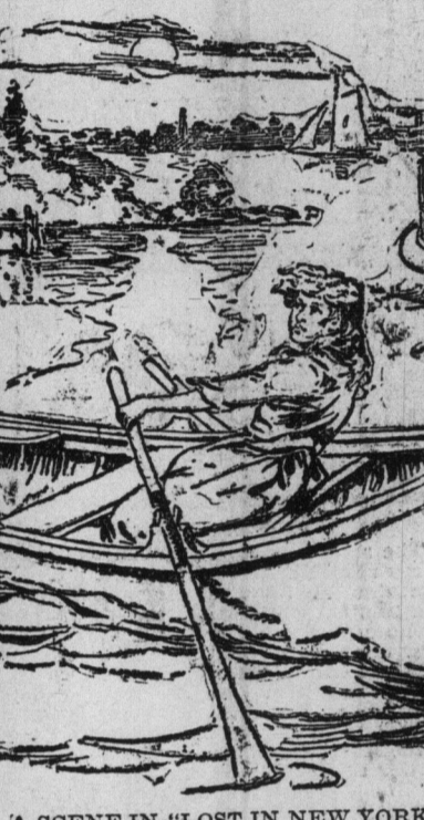
A SCENE IN 'LOST IN NEW YORK'

der Treasurer's office de lar day of dis month. One day dey dey catches dere hand. Der doct. der four months de year.