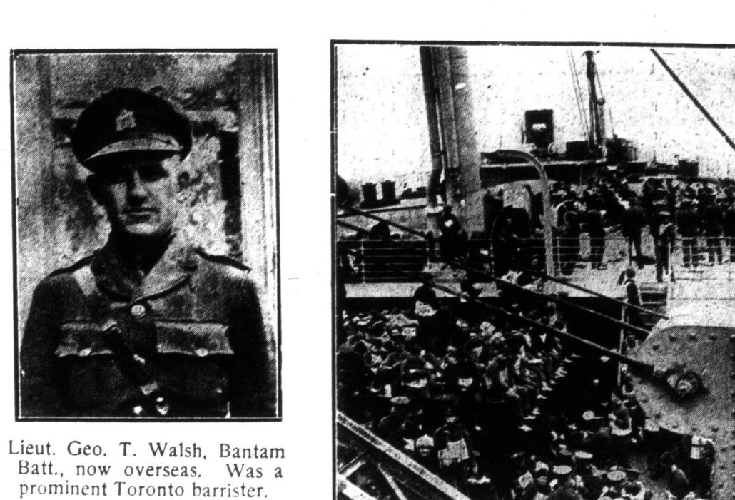
A Canadian battalion on board an Atlantic troopship.