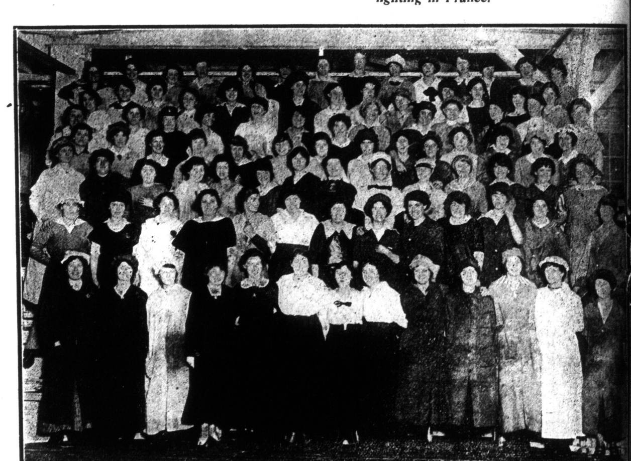
Thread milling and finishing operators on body of 101 gauge fuse 3 p.m. to 11 p.m. shift. Dept. 5 and 5a.