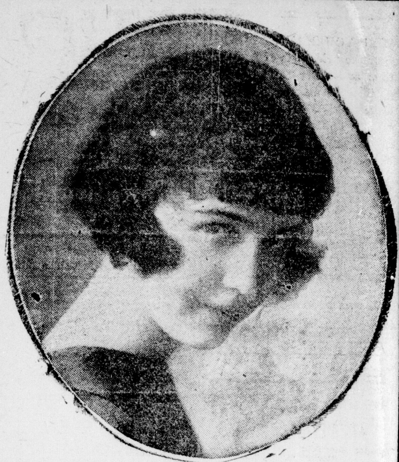
Dorothy Gish, the "Little Disturber," in that greatest of all photoplays produced, "Hearts of the World," showing at the Majestic Theatre again today and Saturday.

200 guests present, including members of the French cabinet, allied diplomats and prominent officials. During the dinner the Republican Guards Band ereigns received the guests of the evening. Toasts of the utmost cordiality were exchanged by President Poincare and King Albert, the bonds of friendship forged during the four years of warfare by the two nations being referred to in most eloquent terms by each of the speakers.