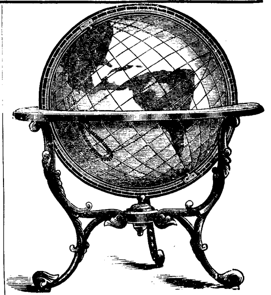
ALL KINDS OF School Supplies

MAP AND SCHOOL SUPPLY CO. 31 KING STREET EAST, TORONTO