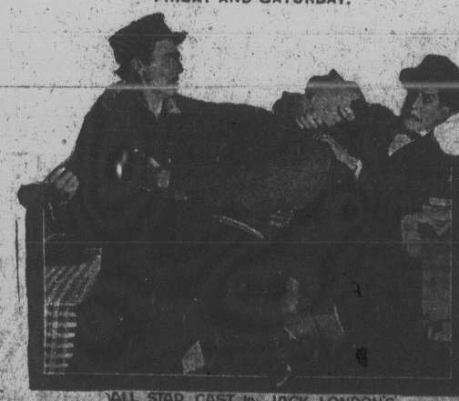
ALL STAR CAST IN JACK LONDON'S "THE MUTINY OF THE EL SINORE"

The mystery of JACK LONDON'S story-telling, his spirit of adventure in the earth's far places, and the fascination of his characters, that brought him millions of readers, are heightened in this screen version of one of his most noteworthy